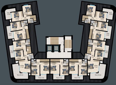
CATI KAT PLANI