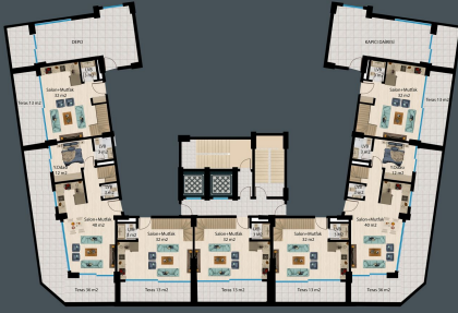
Bodrum Kat Planı