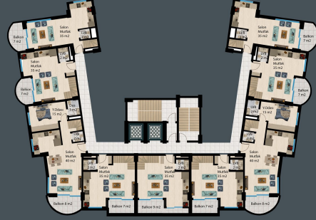
8. KAT PLANI