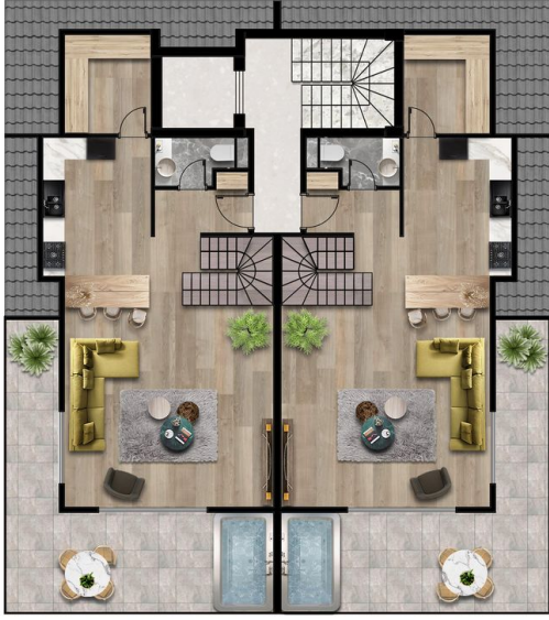
B BLOK-QATI ARASI PLANI