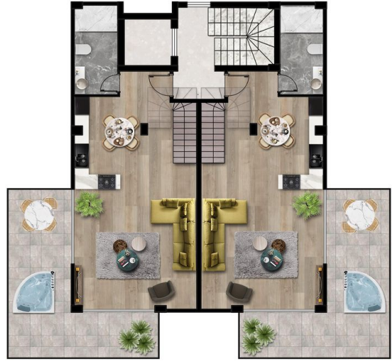
B BLOK-BODRUM KAT PLANI