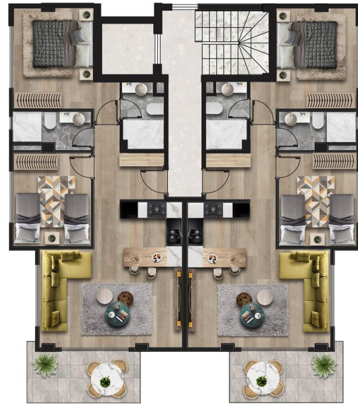
B BLOK-NORMAL KAT PLANI