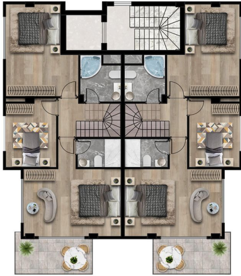
B BLOK-4. KAT PLANI