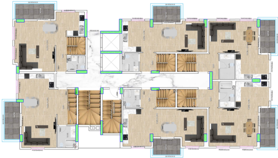
DUBLEX ALT KAT PLANI