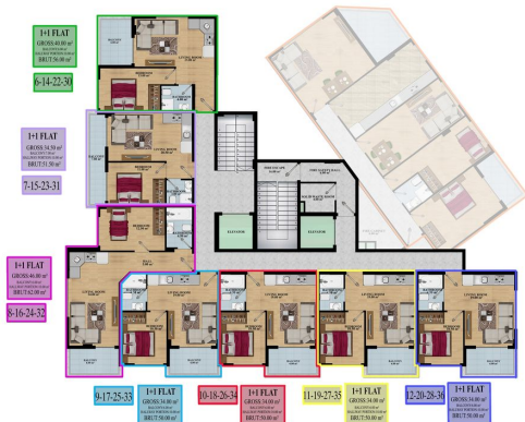
GROUND-1-2-3 FLOOR PLAN