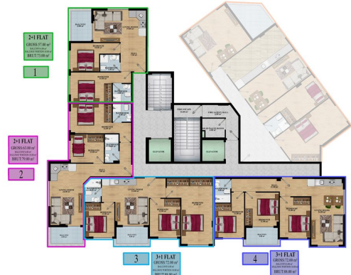
-1 BASEMENT FLOOR PLAN