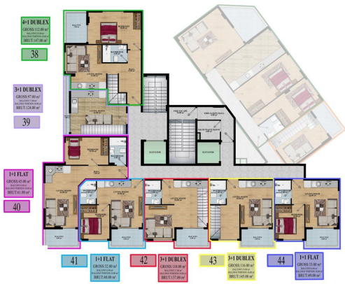
4 FLOOR PLAN