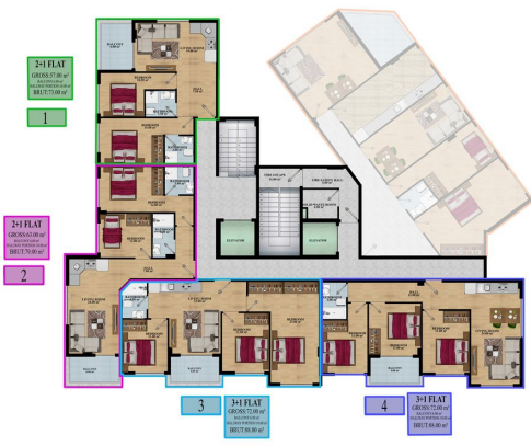
-1 BASEMENT FLOOR PLAN