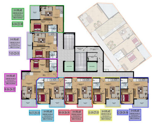
GROUND-1-2-3 FLOOR PLAN