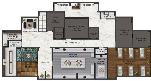
B BLOCK BASEMENT FLOOR PLAN 1