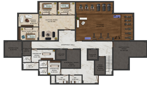
E BLOCK BASEMENT FLOOR PLAN 2