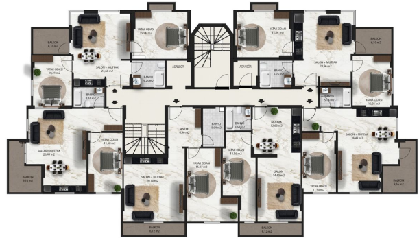
D BLOK 1-8 KAT