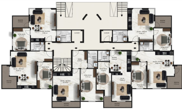
D BLOK ZEMIN KAT