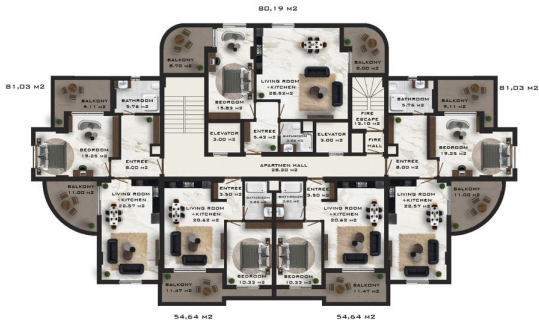
B BLOCK FLOOR PLAN (NORMAL KAT) SCALE 1/50