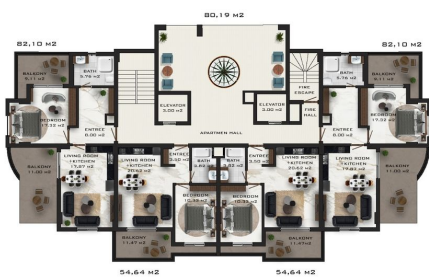
C BLOCK GROUND FLOOR PLAN (NORMAL KAT) SCALE 1/50