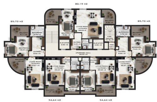
C BLOCK FLOOR PLAN (NORMAL KAT) SCALE 1/50