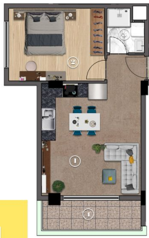
TYPE B 1+1 FLOOR PLAN