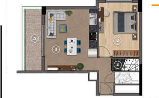
9TH FLOOR PLAN