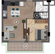
9TH FLOOR PLAN