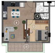
9TH FLOOR PLAN