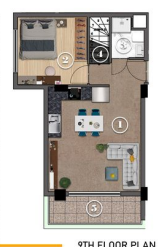
9TH FLOOR PLAN