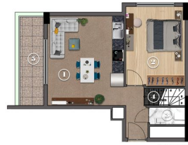
9TH FLOOR PLAN