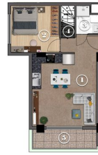
9TH FLOOR PLAN