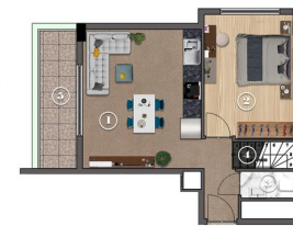
9TH FLOOR PLAN