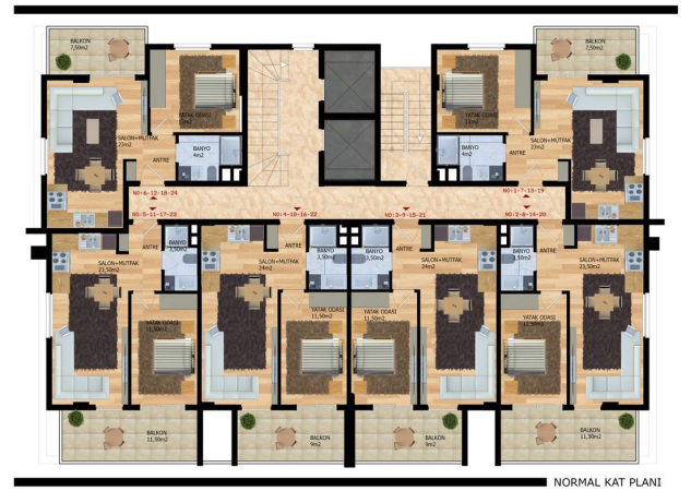
NORMAL KAT PLANI