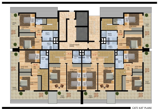
ÇATI KAT PLANI