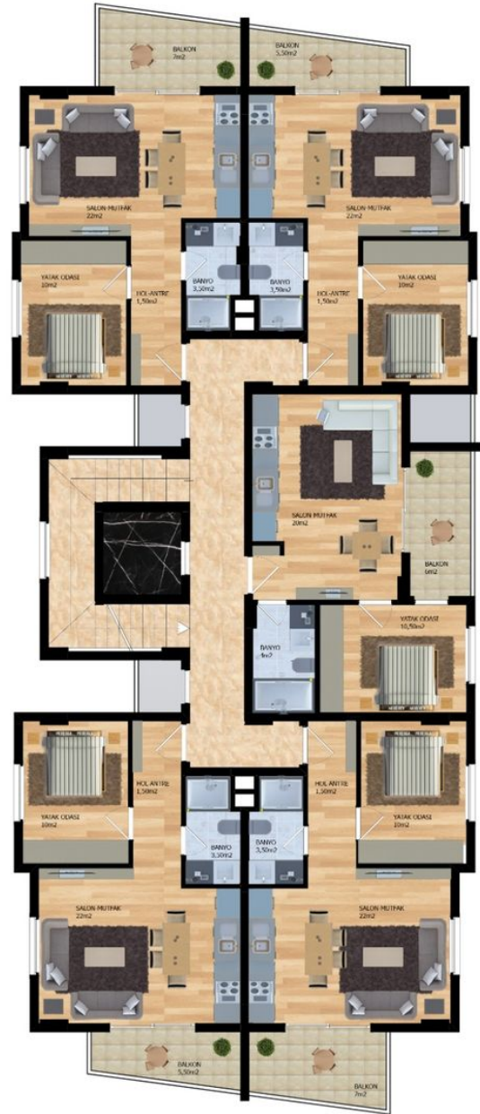
ZEMİN KAT PLANI