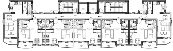
11. KAT PLANI