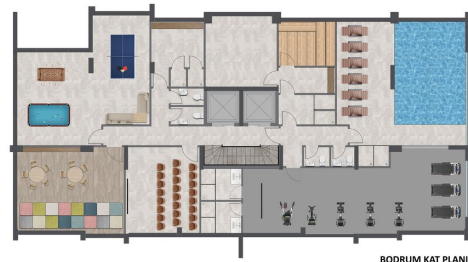
BODRUM KAT PLANI

APŅĪVE 3.00 m 2 SAUCINĀMĀTĪBA 27.80 m 2 BALKŅŅŅ 6.00 m 2 MĒSĀRĀ 3.20 m 2