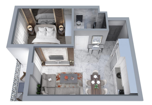
DAIRE NO: 5, 11, 17