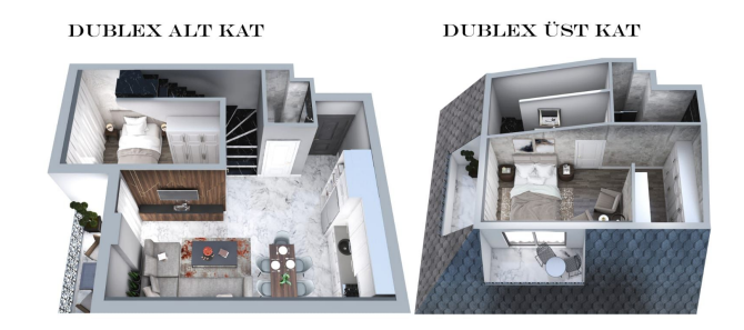
DUBLEX D. NO: 23