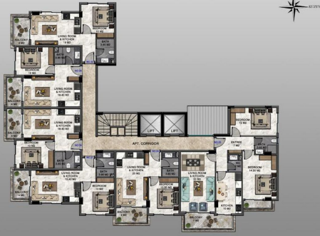
2. FLOOR PLAN