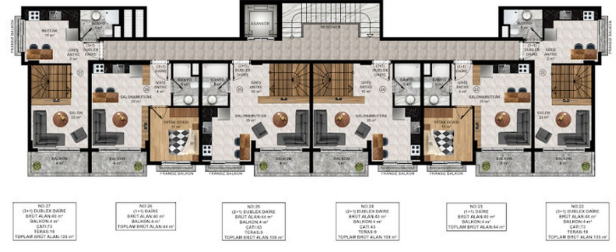
A BLOK 3. KAT PLANI