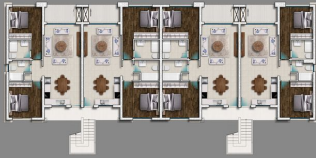
TİP C [2+1 - 3+1 APT DOUBLE BLOCKS]