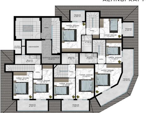
ALTINCI KAT PLANI