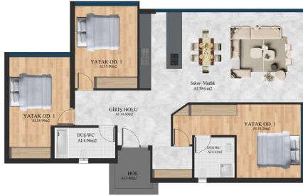
ZEMİN KAT PLANI TIP 2 ÖLÇEK 1/100 BRÜT ALAN:125 m 2