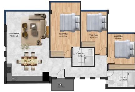
ZEMİN KAT PLANI TIP 3 ÖLÇEK 1/100 BRÜT ALAN:125 m 2