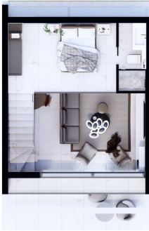
Left Penthouse Second floor 12 m 2