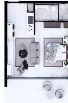
Studio Apartment Ground Floor Total area - 38 m 2