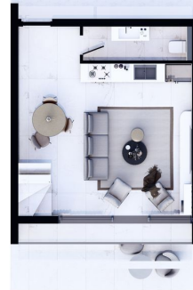
Left penthouse 1st floor Area - 38 m 2