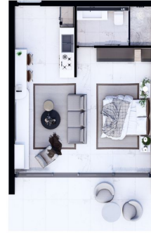
Studio Apartment Ground Floor Total area - 38 m 2