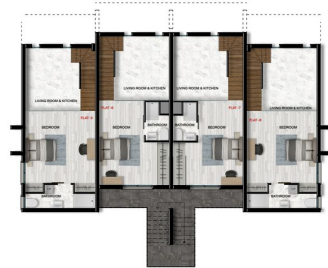
MEZZANINE FLOOR PLAN