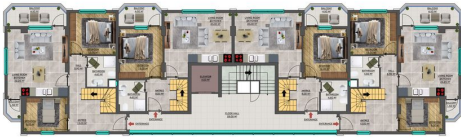
DUBLEX FLOOR PLAN