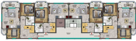
DUBLEX FLOOR PLAN