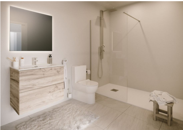
VIVIENDA TIPO B_PLANTA 1ª - 2ª - 3ª - 4ª B. Apartment 1ª - 4ª Floor: 35R + 2S.