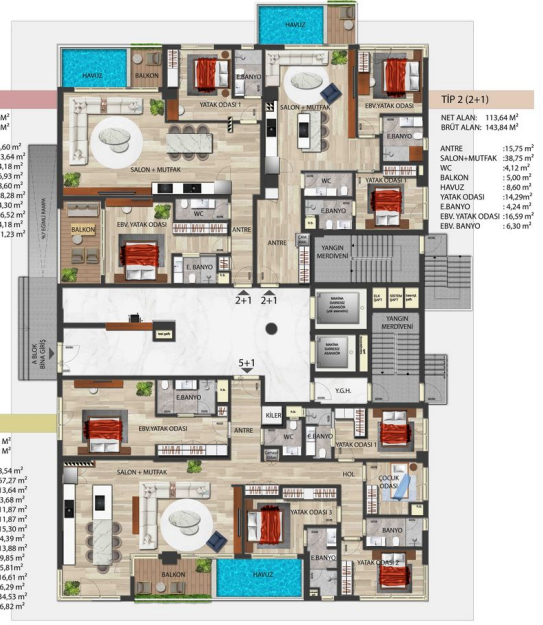
A BLOK ZEMİN KAT PLANI