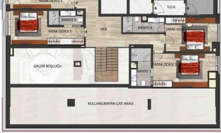
A BLOK ÇATI KATI PLANI (DUBLEX ÜST KAT)

HOL : 16,96 m 2 YATAK ODASI 3 : 21,80 m 2 BANYO 3 : 7,67 m 2 YATAK ODASI 4 : 17,73 m 2 BANYO 4 : 5,03 m 2 YATAK ODASI 5 : 20,13 m 2 BANYO 5 : 4,79 m 2 YATAK ODASI 6 : 28,03 m 2 BANYO 6 : 5,15 m 2 ÇAMAŞIR ODASI : 4,21 m 2