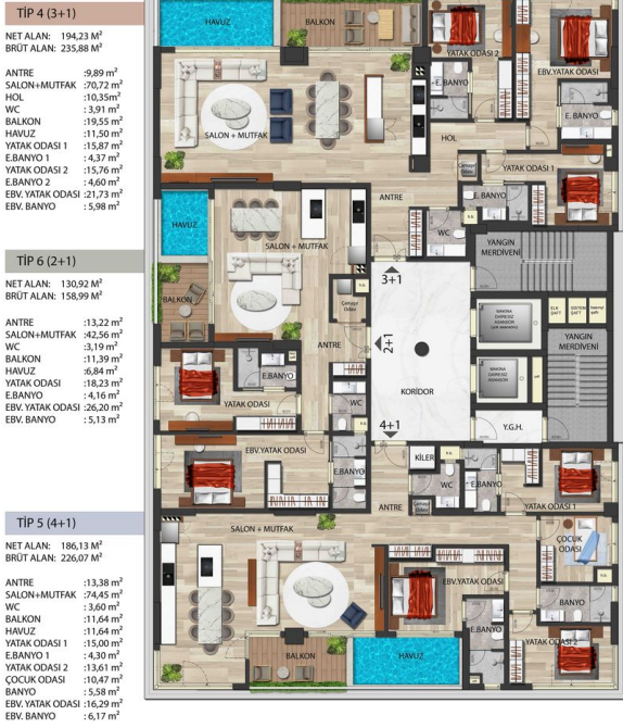
A BLOK 1., 2., 3., 4., 5., 6., 7., 8., 9., 10., 11., 12., ve 13. KAT PLANI