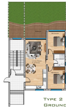
TYPE 2 GROUND FLOOR PLAN