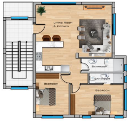
TYPE 2 FIRST FLOOR PLAN