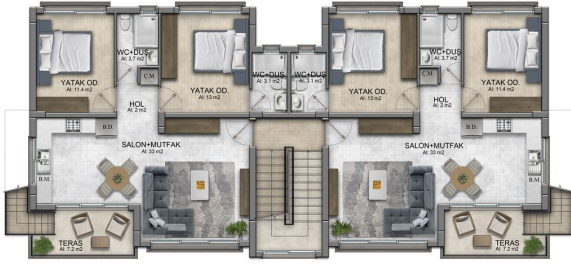
1. KAT PLANI A TIPI