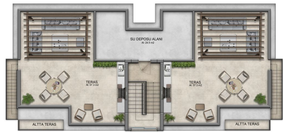
MERDİVEN KULESİ PLANI A TİPİ