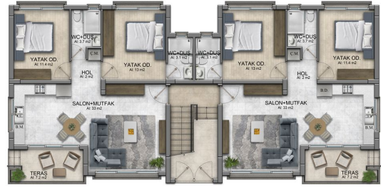
ZEMIN KAT PLANI A TIPI