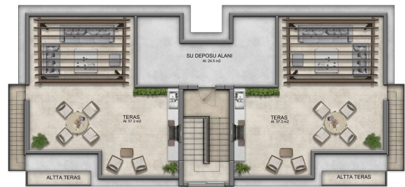
MERDIVEN KULESİ PLANI A TİPİ