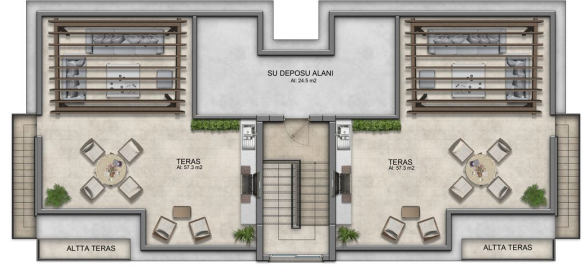
MERDİVEN KULESİ PLANI A TIPI