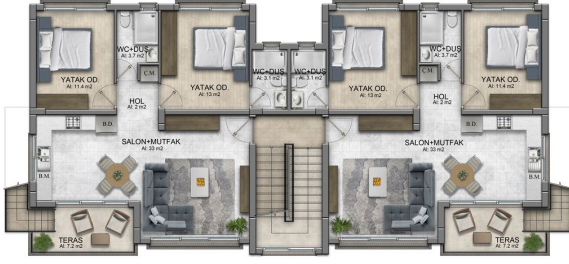
1. KAT PLANI A TIPI