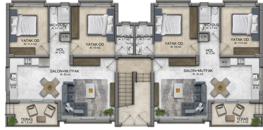
ZEMİN KAT PLANI A TİPİ