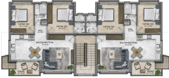
1. KAT PLANI A TİPİ