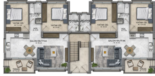
ZEMİN KAT PLANI A TIPI