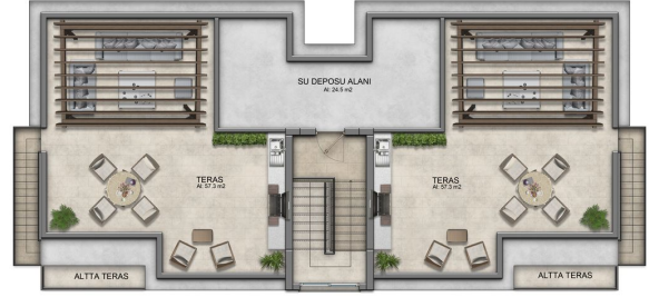
MERDİVEN KULESİ PLANI A TİPİ