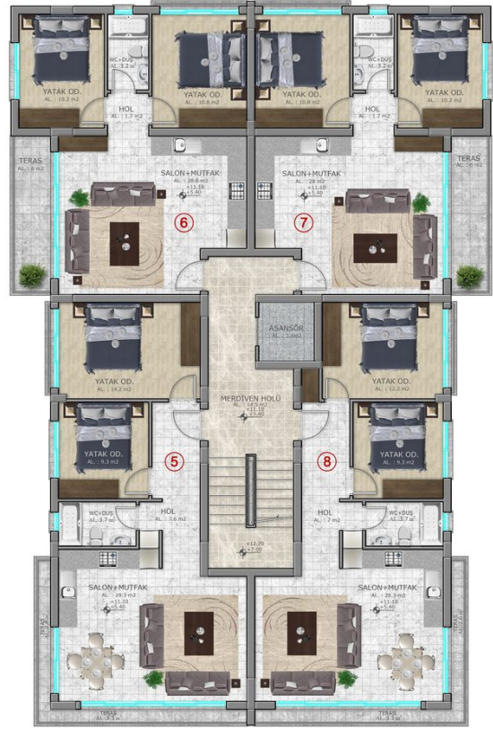
2. KAT PLANI