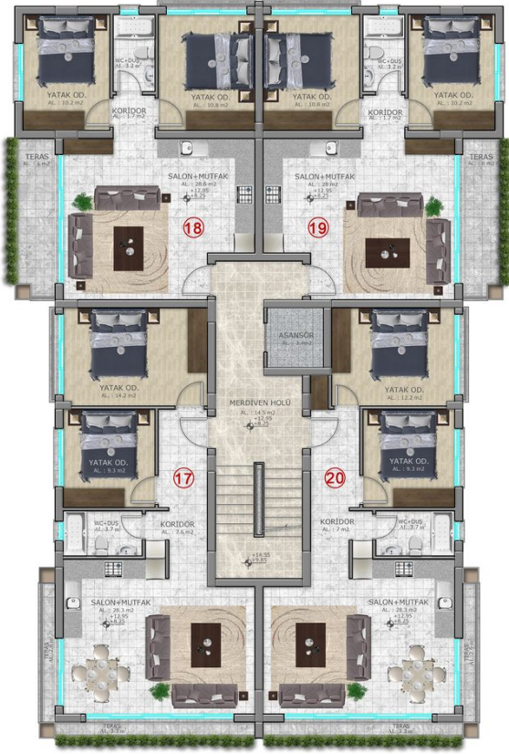
5. KAT PLANI