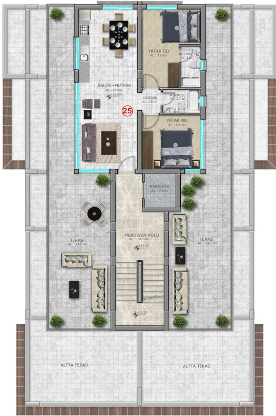
7. KAT PLANI