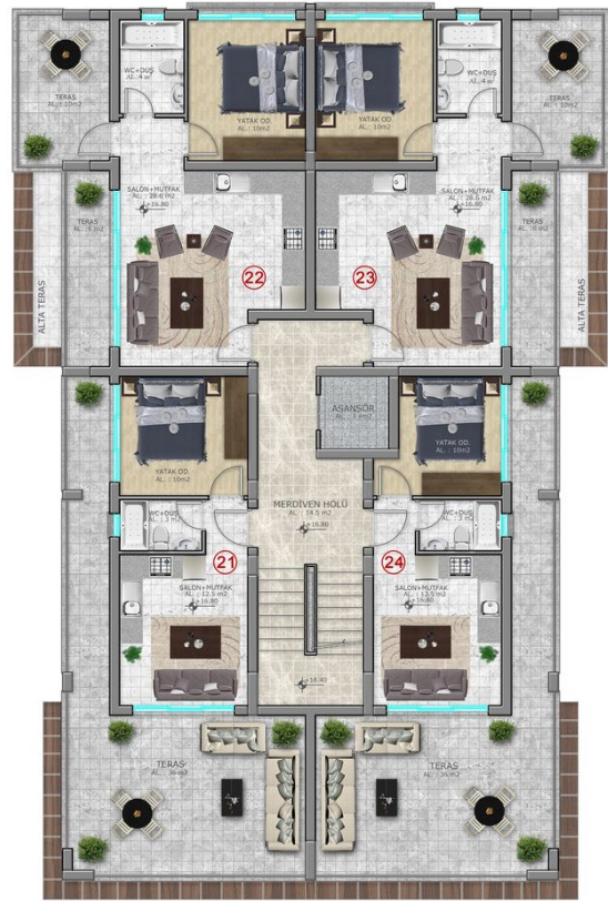
6. KAT PLANI