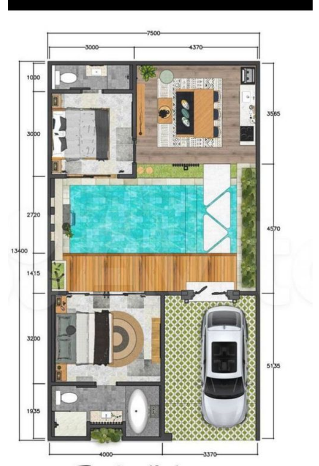
Two One Bedroom