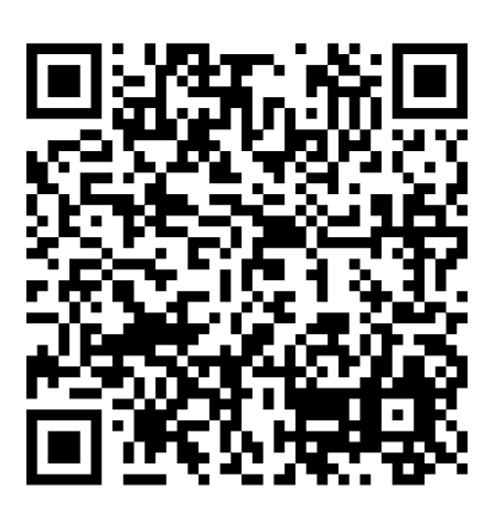
Scan the QR code to open the original page