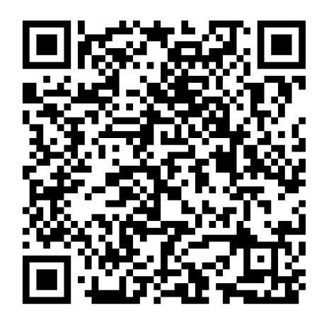
Scan the QR code to open the original page