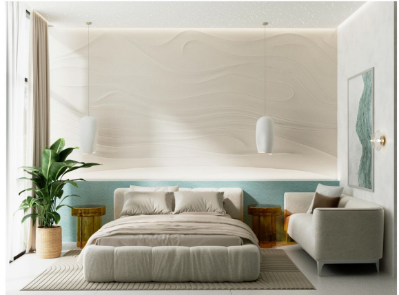
Bedroom of Small Apartment