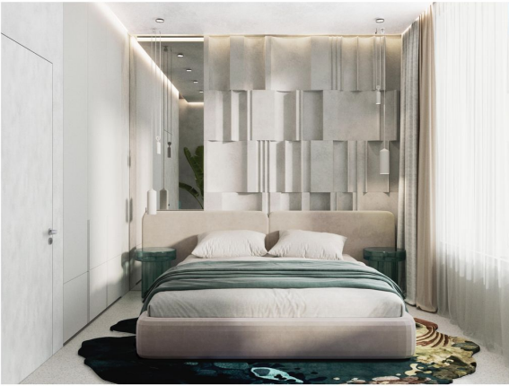
Bedroom of Town House