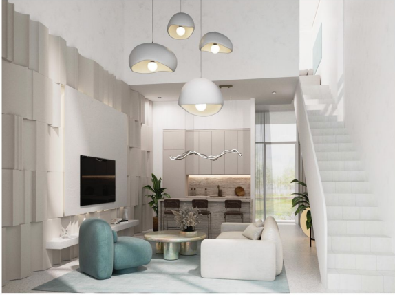
Kitchen & Living Area of Town House