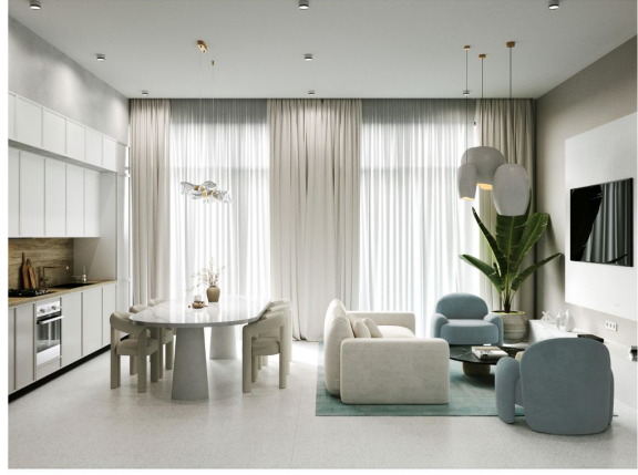
Kitchen & Living Area of Villa 3 Bedrooms