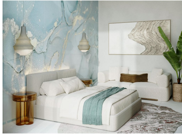
Bedroom of Villa 3 Bedrooms