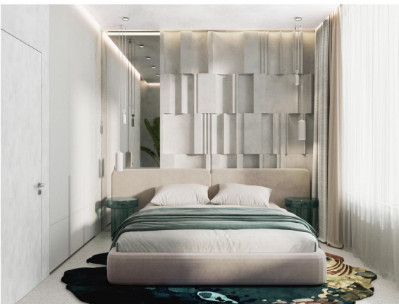
Bedroom of Town House