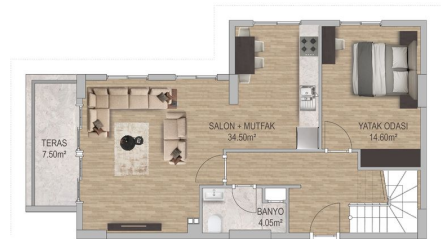
DUBLEKS DAIRE - TIP | 2