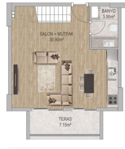
DUBLEKS DAIRE - TIP | 3