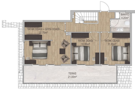
DUBLEKS DAIRE - TIP | 3