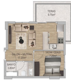
TIP | 4