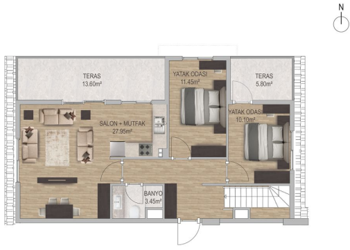
DUBLEKS DAIRE - TIP | 1