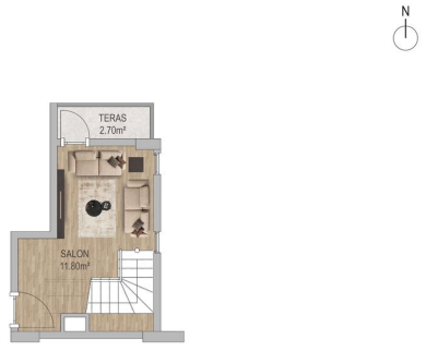
DUBLEKS DAIRE - TIP | 1