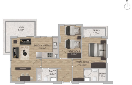
TIP | 1