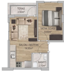
TIP | 3