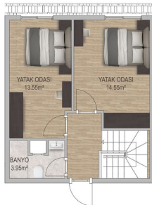
DUBLEKS DAIRE - TIP | 2