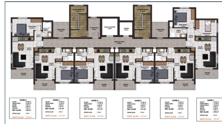
B BLOK NORMAL KAT PLANI