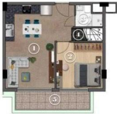
9TH FLOOR PLAN