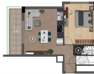
9TH FLOOR PLAN

Interest-free Installment payment till 12/2024