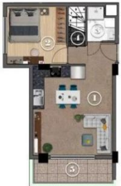
9TH FLOOR PLAN