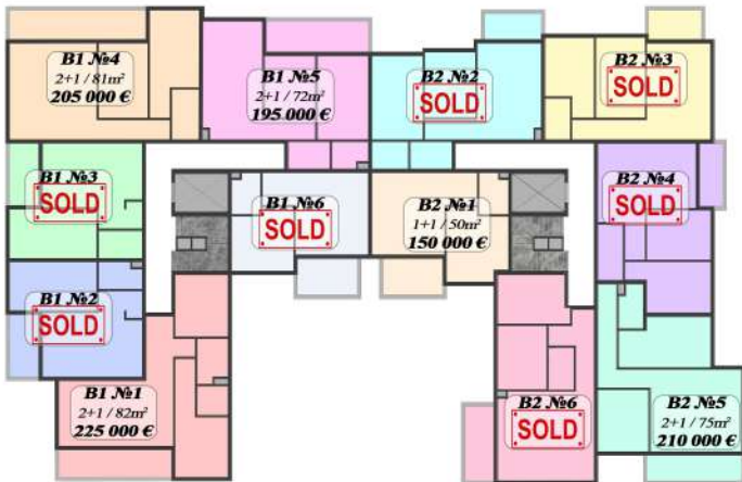
1. FLOOR PLAN