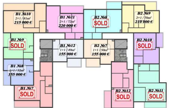
2. FLOOR PLAN